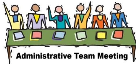
Administrative Team Meeting

Join us today after worship to see the documentary Happy . Brunch will be served. This is not a children's movie, but is appropriate for anyone twelve and older. Watching this movie might make your life just a little better.