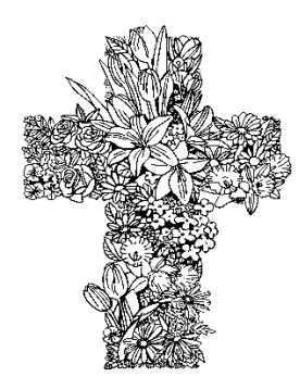
Flowers for the Cross

There is <u>strength</u> in the name of the Lord There is <u>power</u> in the name of the Lord And <u>there</u> is hope in the name of the Lord Blessed is He, who comes, <u>blessed</u> is He, who comes Blessed is He, who <u>comes</u> in the name of the Lord In the name of the Lord, in the name of the Lord