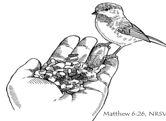
Matthew 6:26, NRSV

Look at the BIRDS of the air; they neither SOW nor REAP ... your heavenly FATHER feeds them. Are YOU not of more value than they?